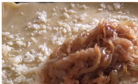
Add the onion and cheese