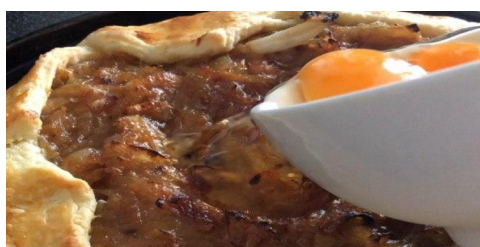
Add the eggs are 15 mins of baking