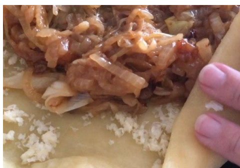
Fold the crust up