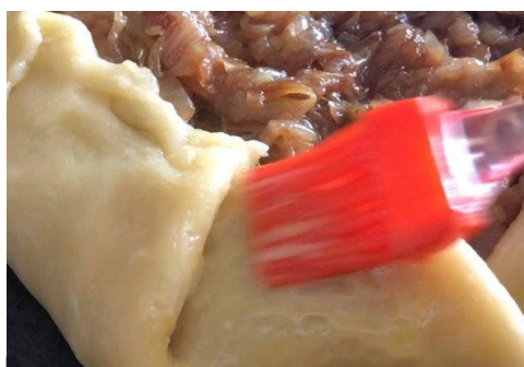
Brush with egg wash